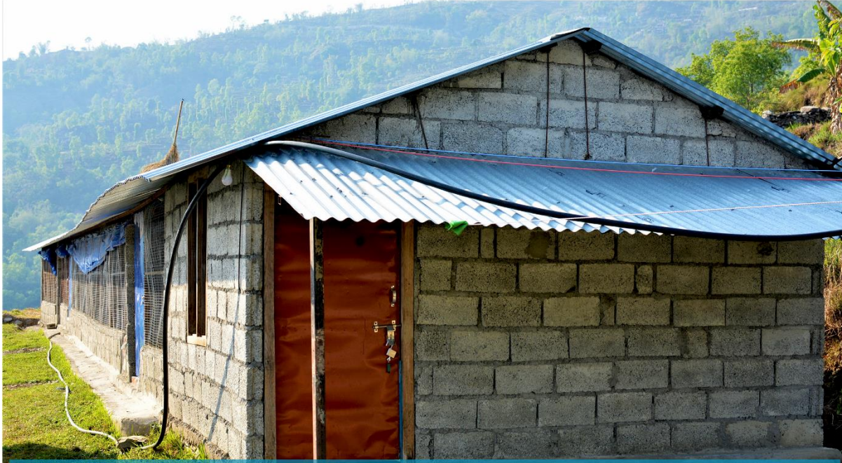
"A Loving Secure, Home for Orphan Children of Nepal"

During the lockdown, eventually all schools shut down and children had nothing to do. So, we planned to give them training, some children went farm for agriculture training and some stayed at home.