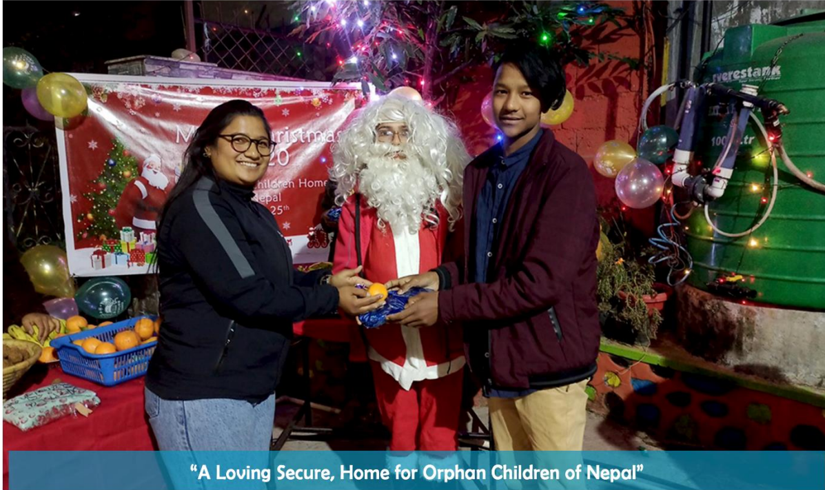
"A Loving Secure, Home for Orphan Children of Nepal"

We also celebrate Christmas in Rainbow Children Home. One of the children from rainbow dressed up like a Santa Claus. All the children got surprise gifts, chocolates, and fruits from the Santa Claus. We also had organized a rice pudding for everyone. Everyone sang and dance at the night. it was a memorable and unforgettable moment.