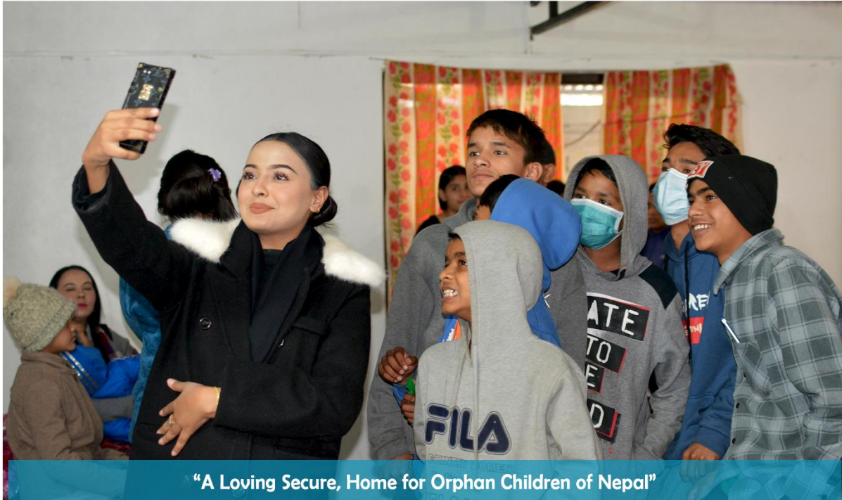
"A Loving Secure, Home for Orphan Children of Nepal"

We normally have guests who want to share their birthday time with children. This time also we had people who celebrated their birthday in RCH. First of all, they take permission to celebrate the birthday with children. After granting the permission, they brought cake and chocolates with them. After that, we celebrated the birthday with joy and happiness. Our children also shared their talents with them.