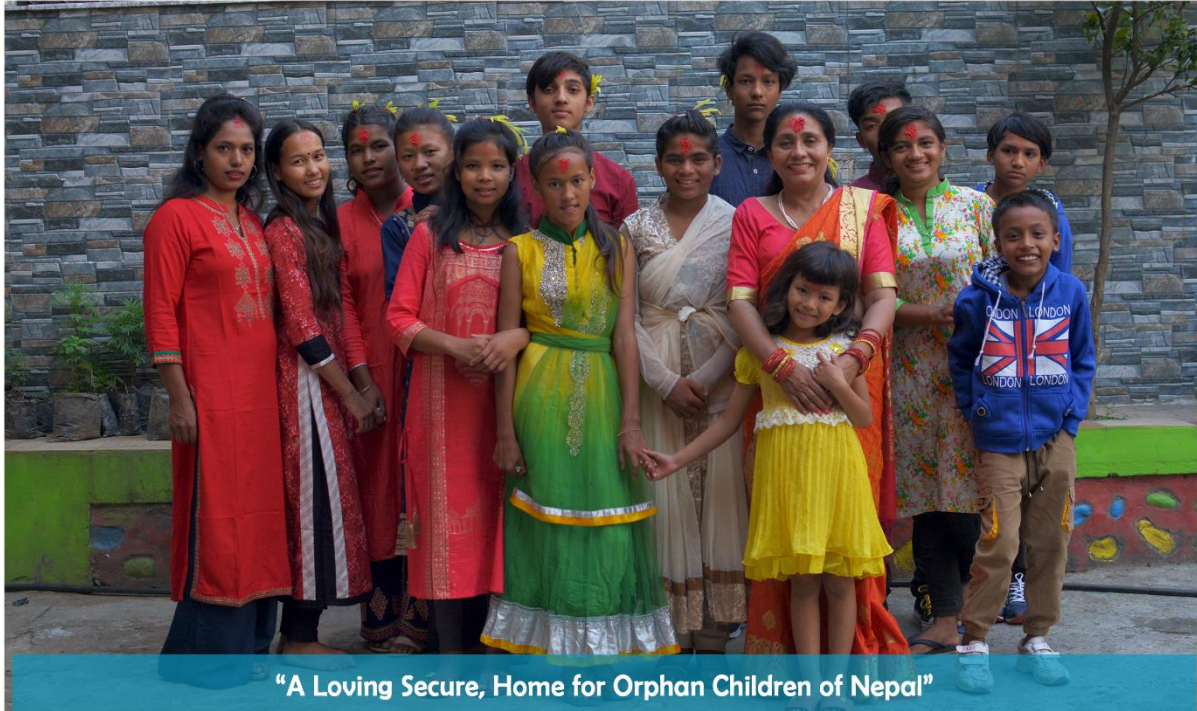
"A Loving Secure, Home for Orphan Children of Nepal"

We celebrated the biggest festival of Hindu, Dashain. At this festival, the people go to their relative's house and put tika and jamara and take blessing from the relatives. Like Every year some of the children went to their village to celebrate Dashain and some of them celebrated Dashain in RC. We tried to keep it low-key and make sure everyone was safe and responsible.